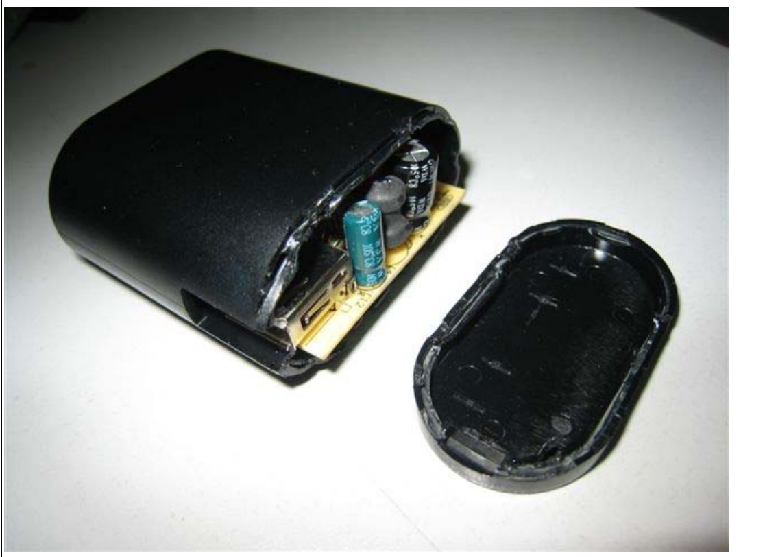
5) Case opened