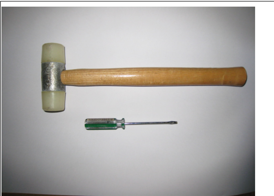
2) Required Handtools