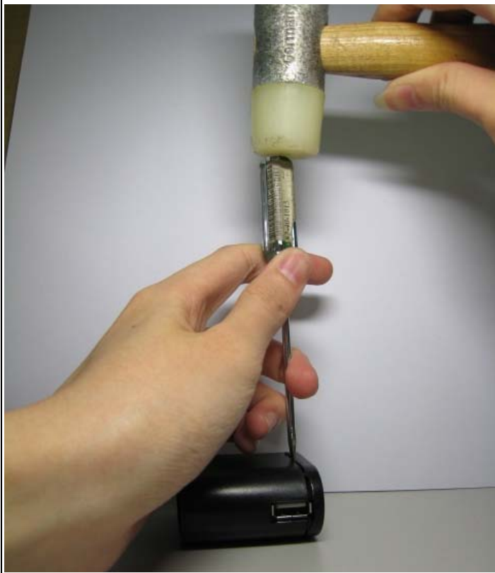
3) Pry case open