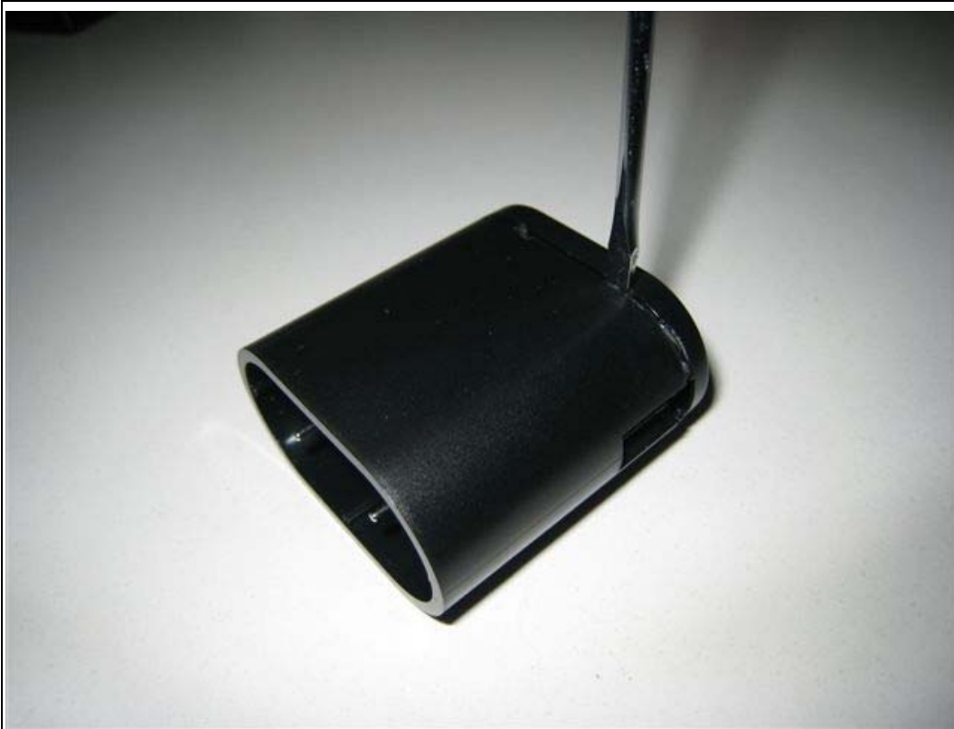
4) Pry case open